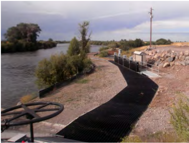
Top photo: The Chester Hydropower Project's powerhouse is complete and three turbines will begin generating energy this summer. The fish ladder can be seen on the left side of the powerhouse.