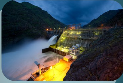
Hells Canyon Dam — A concrete gravity hydroelectric dam located on the Snake River .