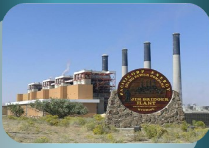
Jim Bridger Power Plant — A 2,119 MW coal-fired.