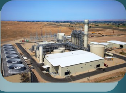
Langley Gulch — Combined cycle combustion turbine natural gas power plant.