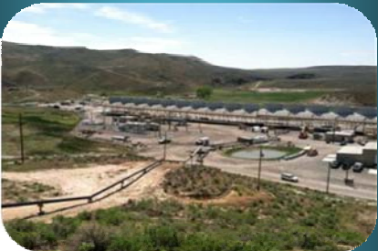
Neal Hot Springs — geothermal power plant near Vale, Oregon.