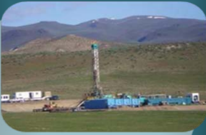
Drilling a geothermal well.