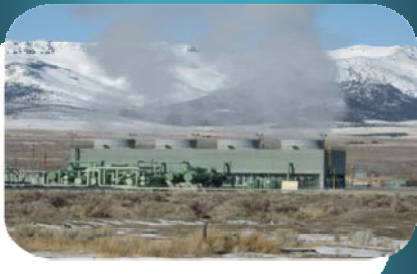
Raft River, Idaho — Water Cooled Binary Cycle Geothermal Power Plant.