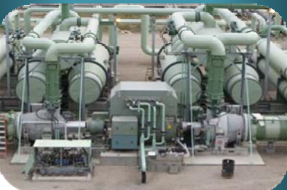
Advanced Binary Cycle Plants — are efficient and automated.