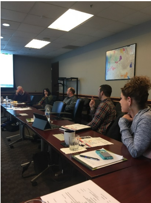
Conservation is a collaborative effort.