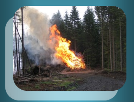
Open burning of forest residues produces more air pollution than wood bioenergy production.