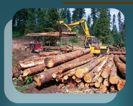
Harvesting timber provides familywage jobs and useful products, with energy feedstocks as a by-product.